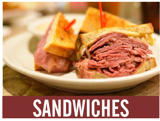
Served deluxe with soup or salad or coleslaw or French fries add 1.99